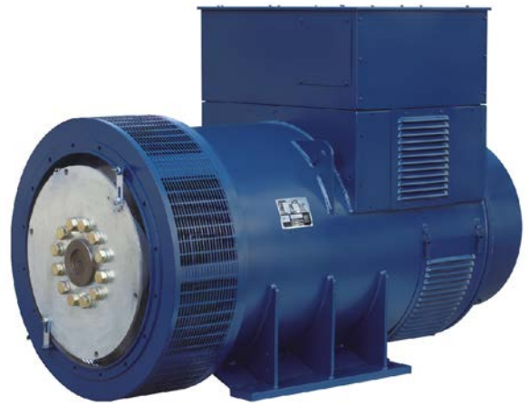
WHI 6 三相陆用发电机功率 WHI 6 3-PHASE INDUSTRY ALTERNATORS POWER